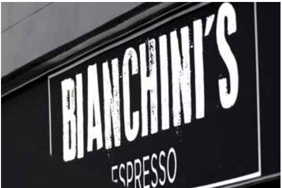
Bianchini's Espresso // 2.8 km • 6 min drive