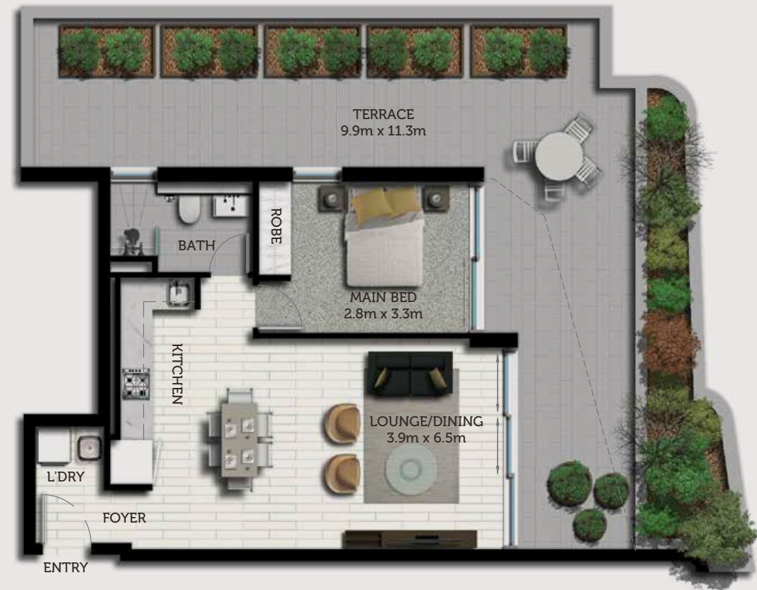
FLOOR PLAN 1 BEDROOM EXAMPLE