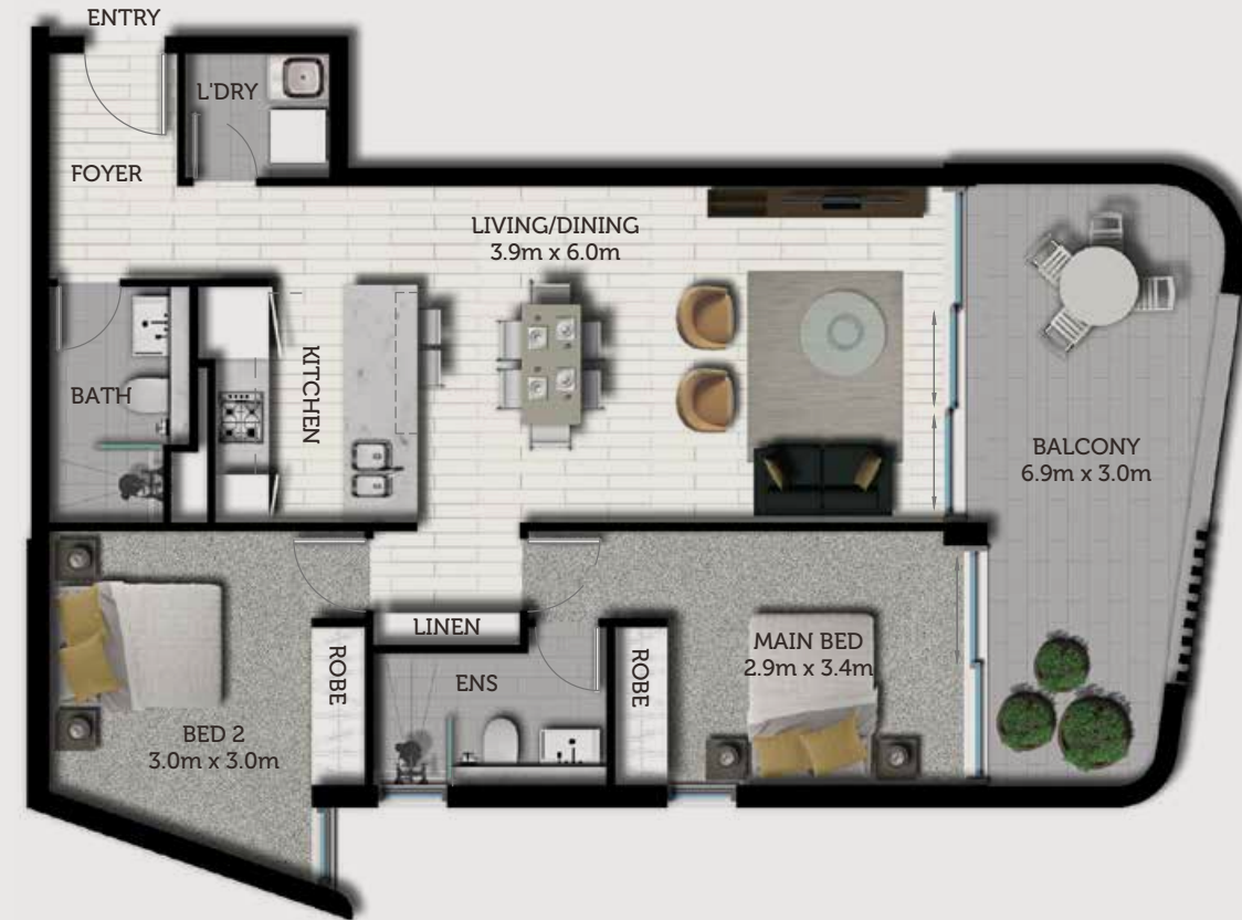
FLOOR PLAN 2 BEDROOM EXAMPLE