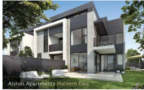
Alston Apartments Malvern East