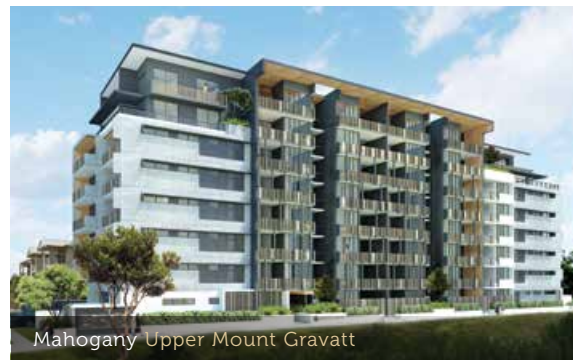
Mahogany Upper Mount Gravatt

Since inception in 1999, Quantum has managed property development projects in excess of $1.4 billion