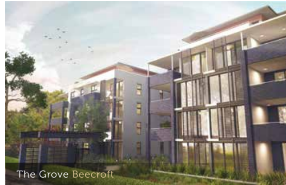
The Grove Beecroft