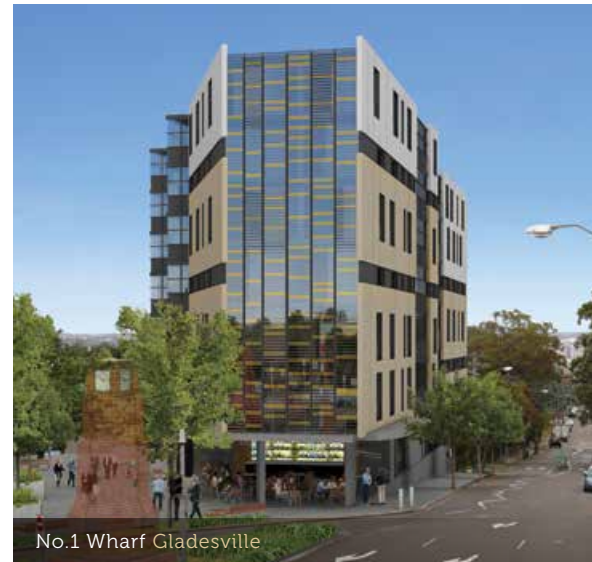
No.1 Wharf Gladstone