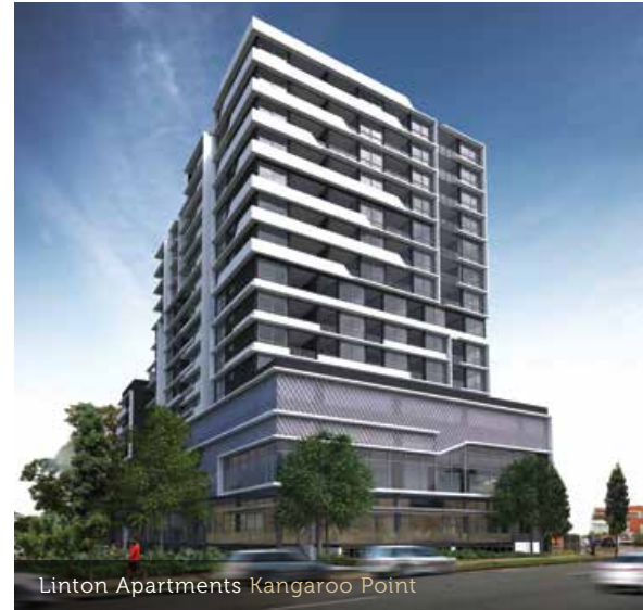
Linton Apartments Kangaroo Point