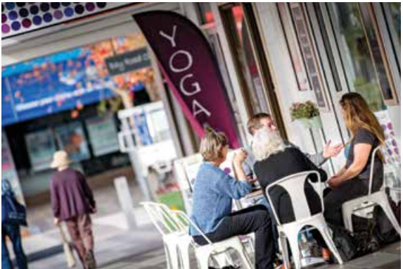
GyMEA // 2.8 km • 6 min drive