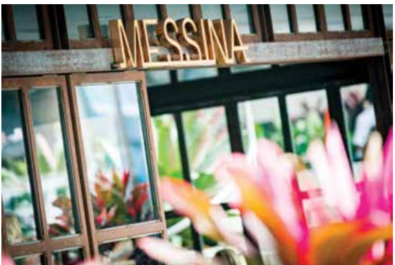
Gelato Messina // 4.1 km • 6 min drive

Jam-pack your days with all the The Shire has to offer. Start your day with a bush walk in the exquisite Royal National Park. After your morning of discovery, make a fuel stop at one of the many gourmet cafes nearby before you embark on an afternoon of retail therapy and relaxation.