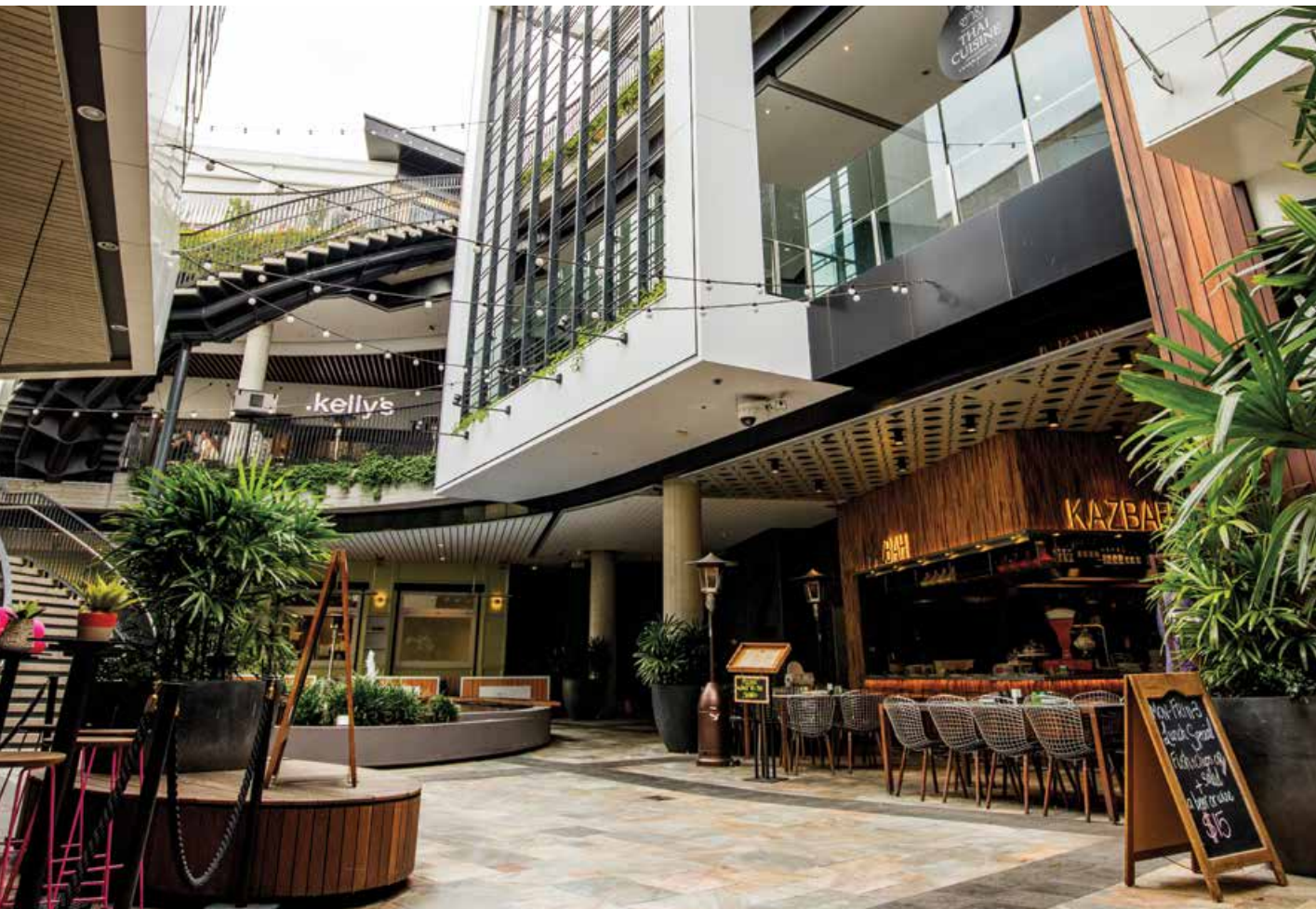
Westfield Miranda // 4.1 km • 6 min drive

When you discover The Shire, it's likely it will be your home for generations to come.