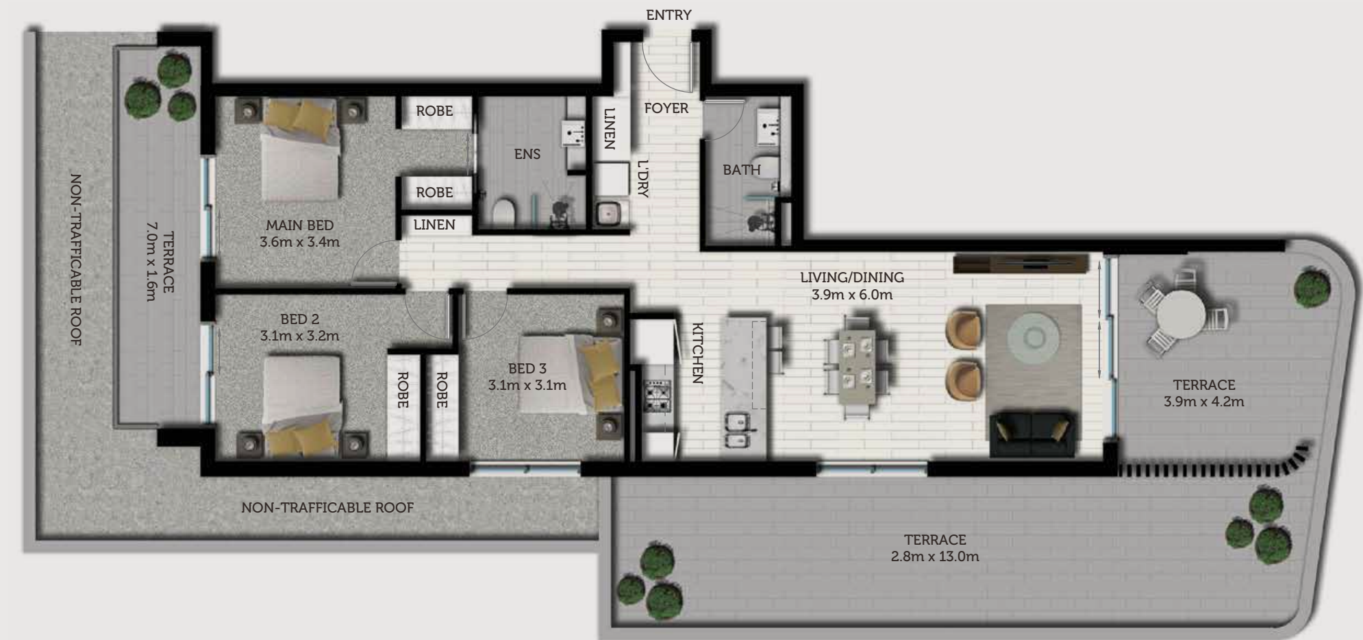
FLOOR PLAN 3 BEDROOM EXAMPLE