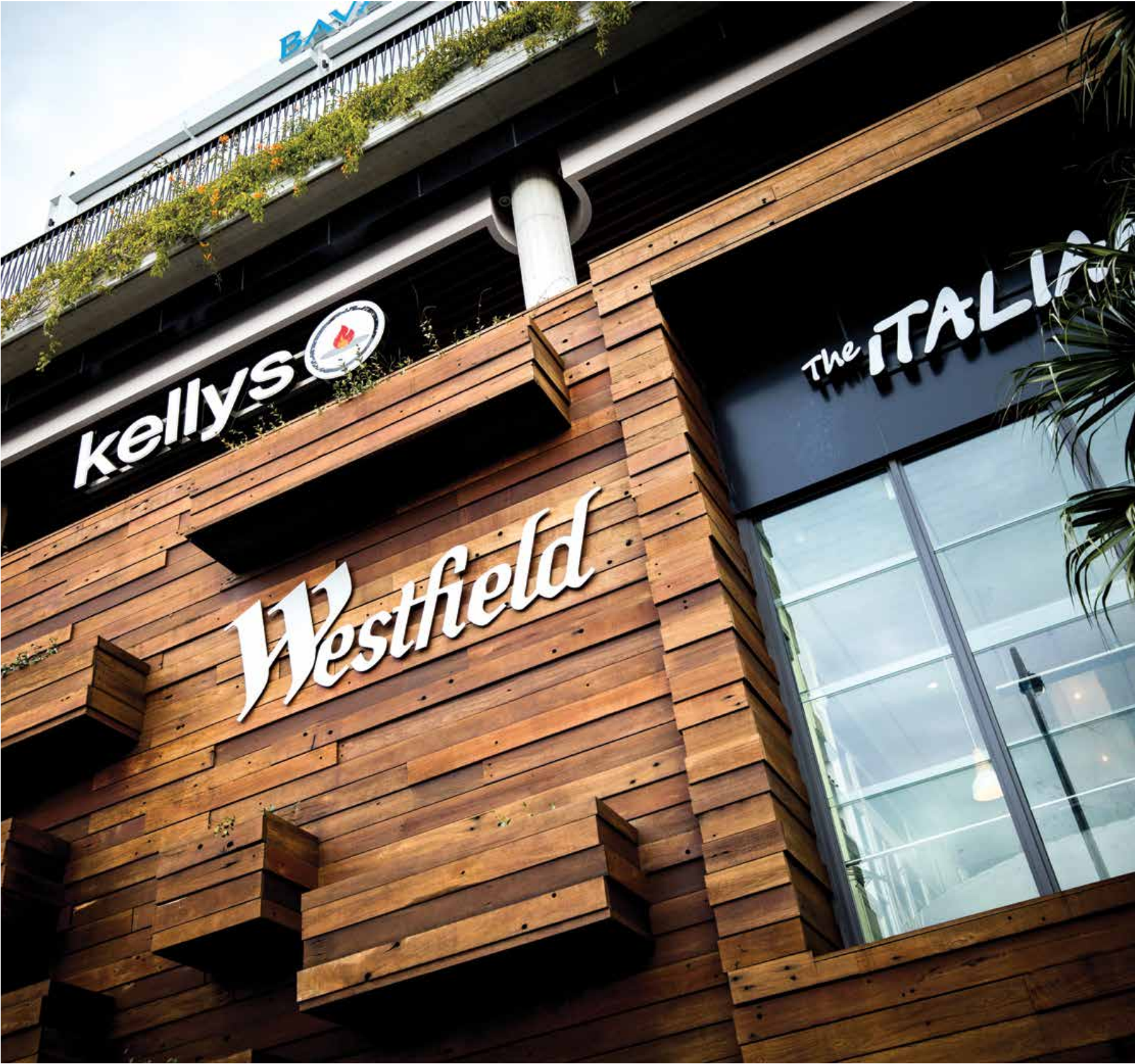
Westfield Miranda // 4.1 km • 6 min drive

Blessed with the perfect combination of lifestyle amenities, natural landscapes and local down-to-earth culture, Adelong is in the heart of a locale that you will be excited to call home and proud to play tour-guide to friends and family.