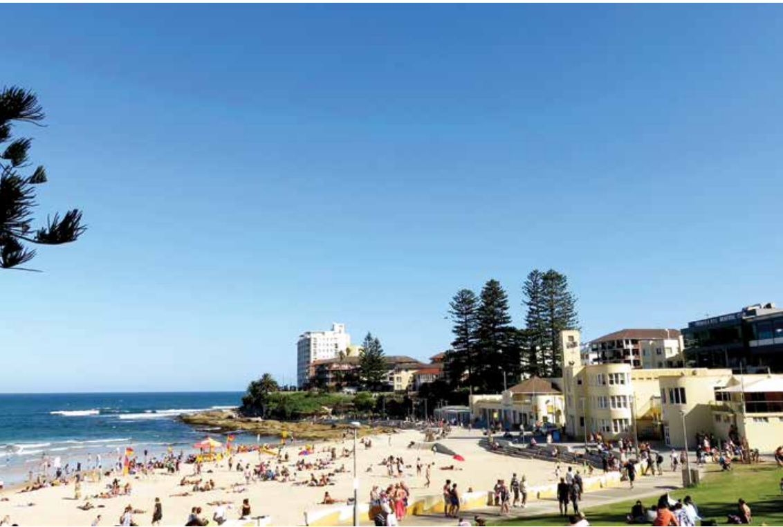
Cronulla Beach // 9.4 km • 14 min drive

Jam-pack your days with all the The Shire has to offer. Start your day with a bush walk in the exquisite Royal National Park. After your morning of discovery, make a fuel stop at one of the many gourmet cafes nearby before you embark on an afternoon of retail therapy and relaxation.